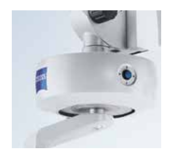
Motorized precision Make fine adjustments in microscope positioning with greater precision with the foot control panel motorized X-Y coupling.