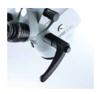
Easy to position Comfortable handgrips enable you to position the microscope even under draped and sterile conditions.

OPMI VISU® 140 from ZEISS is a compact and flexible ophthalmic surgical microscope that is straightforward, functional and economical.