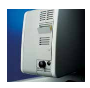
Uninterrupted surgery Automatic lamp replacement ensures uninterrupted operation in case of a light bulb failure.