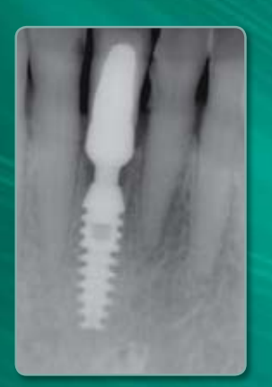
4 Years Post Op