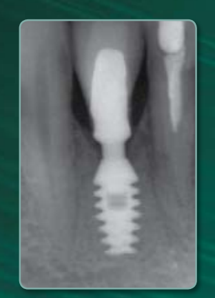
4 Years Post Op