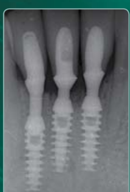
2 Years Post Op